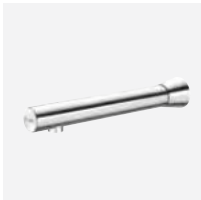
Wall-mounted chrome L. 220mm