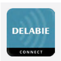
Certain BINOPTIC 2 models can be configured via Bluetooth®