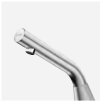
Satin finish H. 100mm