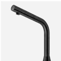
Matte black finish H. 250mm