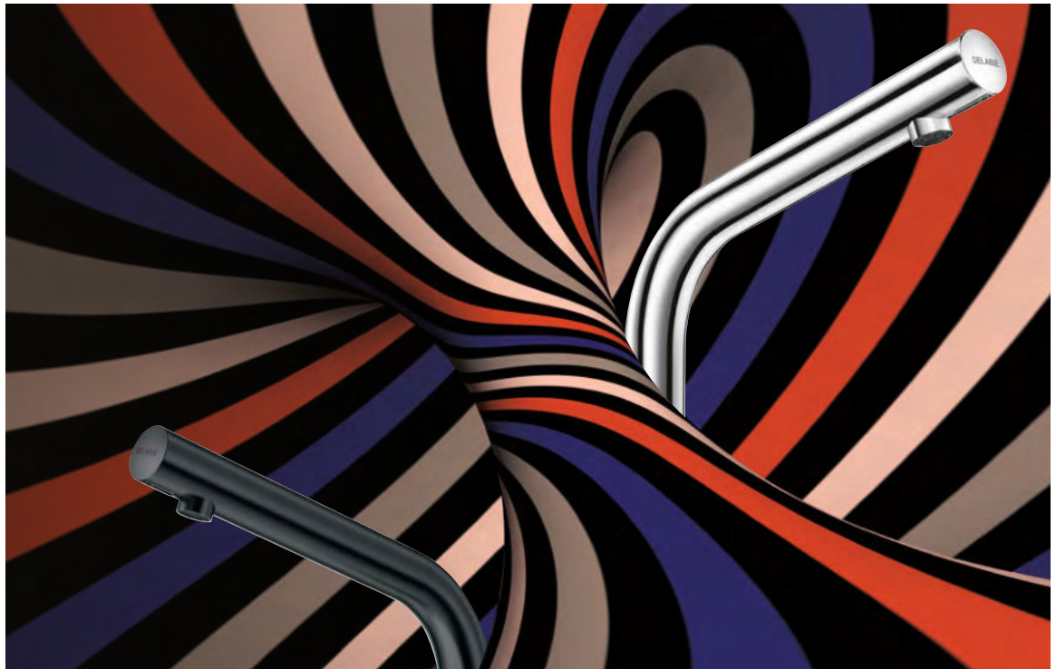
DELABIE refs.: 474 110 (chrome) and 375 130 (matte black)

DELABIE, the European leader in taps and sanitary ware for public places, is proud to present the new BINOPTIC 2 electronic basin tap range—an innovative solution that combines performance, aesthetics, and durability to meet the evolving challenges of public and commercial washrooms.