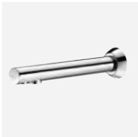
BINOPTIC - L. 200mm