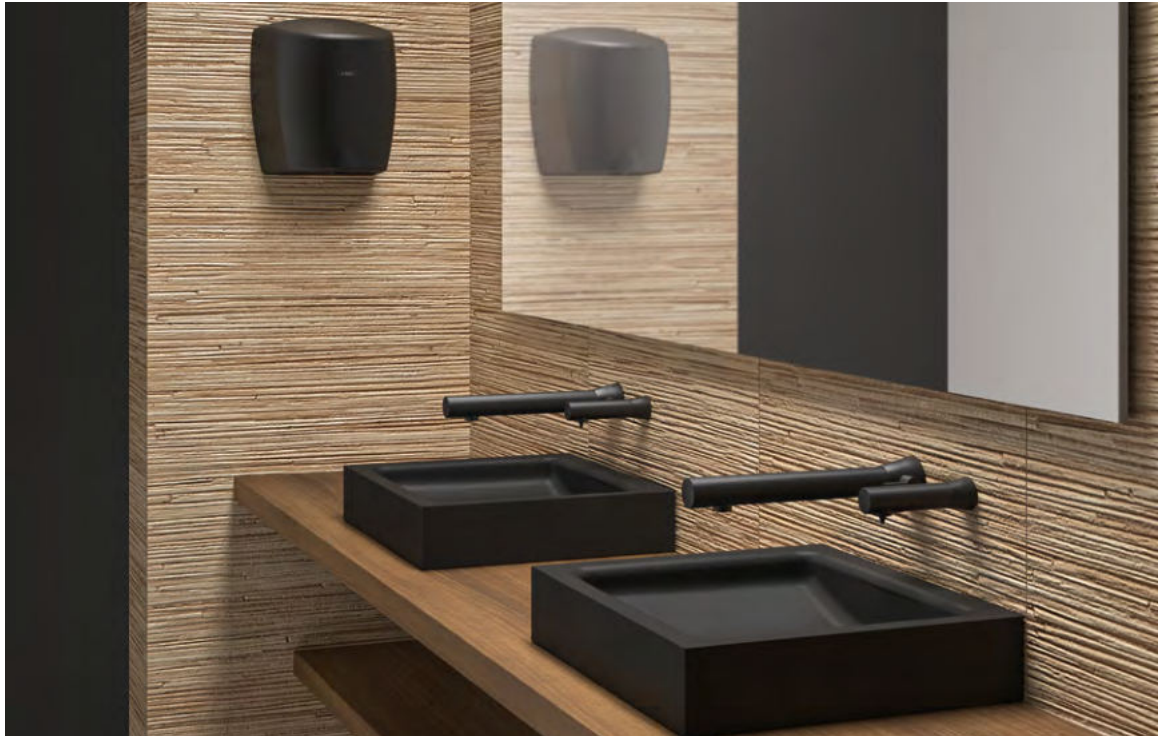
DELABIE refs.: 48203015, 512111BK, 120810BK, 510622BK

Public washrooms have evolved into a showcase of hygiene and design for an entire establishment. To meet this growing demand, DELABIE, expert in sanitary ware for public and commercial places, offers a seamless combination of BINOPTIC electronic taps and soap dispensers.