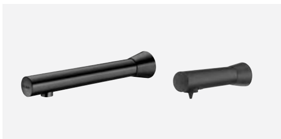
BLACK BINOPTIC 2 wall-mounted black electronic tap and BINOPTIC wall-mounted black electronic soap dispenser DELABIE references: 384130, 512051BK